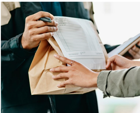
Self-Opening Style Paper Bag