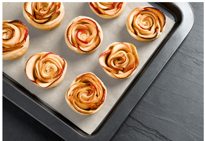
Pan Liners & Baking Sheets