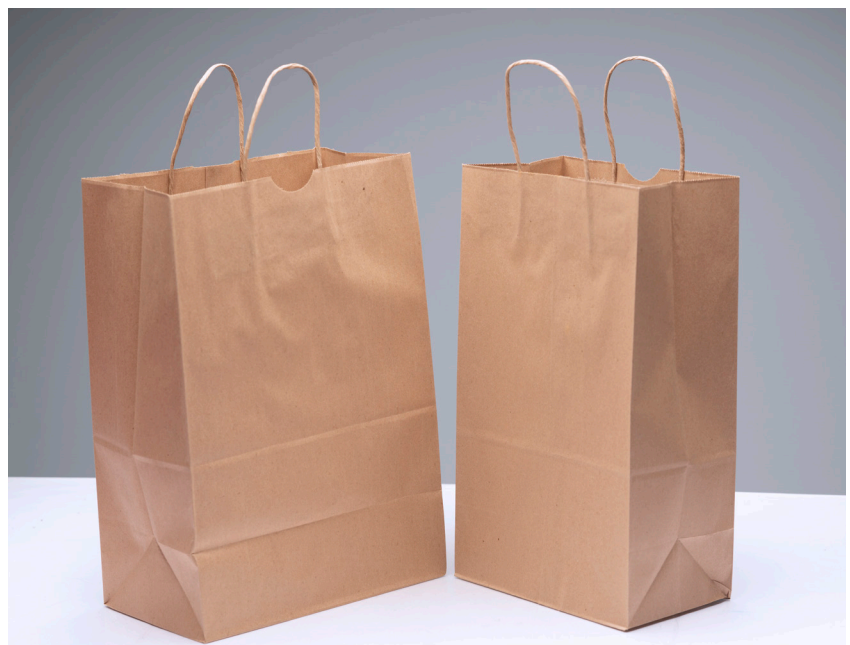
Twisted Paper Handle Bags