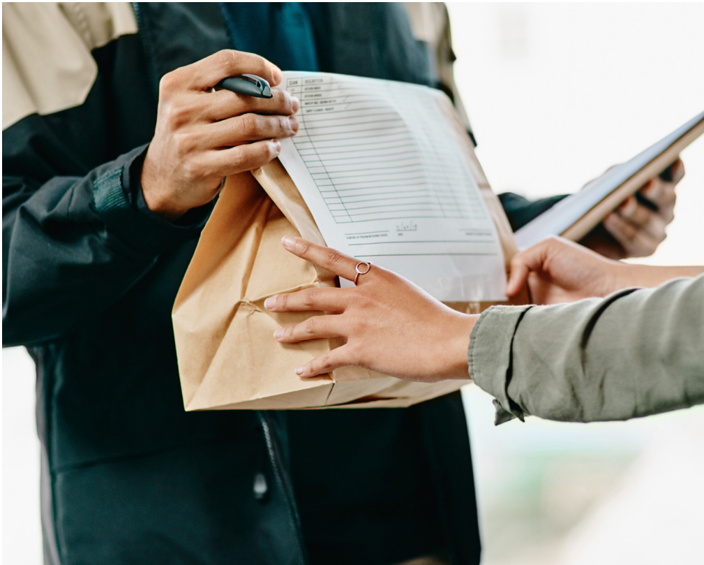
Self-Opening Style Paper Bags

Perfect for supermarkets, convenience stores, gift shops, cash & carry stores, restaurants, delis, bakeries, and farmers markets.